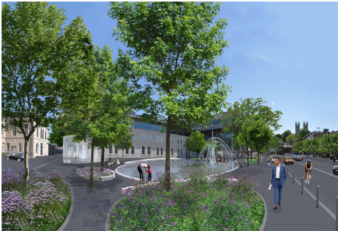
Architectural rendering courtesy of Janet Rosenberg + Associates, Landscape Architects / Urban Design.

GUELPH's beautiful old City Hall is about to undergo a major renewal of its historic market grounds.