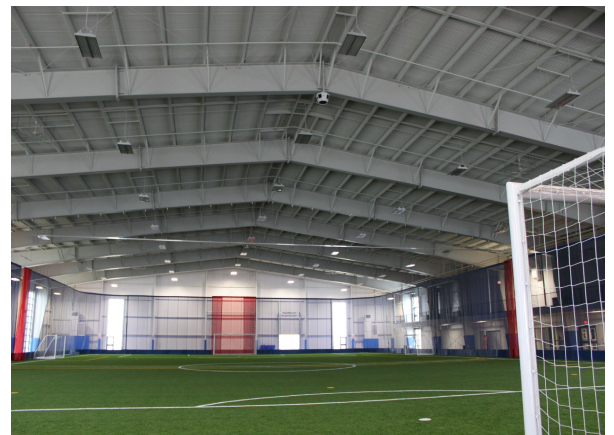
Interior showing 40 m x 70 m synthetic turf playing field.

This 56,000 s.f. engineered Butler building includes an indoor artificial turf playing field, a 4-lane 220 m rubber indoor running track for year round use, and 625 s.f. of meeting facilities.