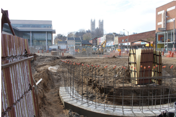
Guelph's new Market Square project underway.

limestone. The building is a local treasure and has long been a focal point of the city. In 1984 it was designated a National Historic Site.