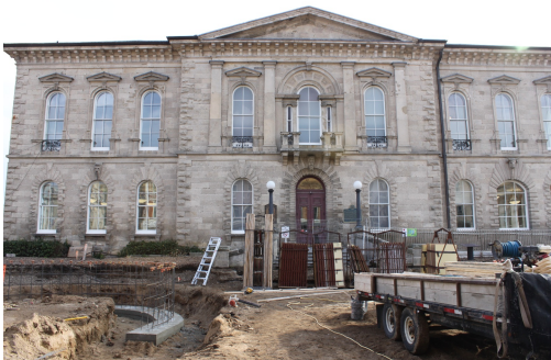
Construction of new planters in front of City Hall.

trees, plants, flowers and other elements to further complement what will become a very attractive and inviting public space. KMA will be providing all of the architectural concrete elements including the featured ice skating rink / water feature.