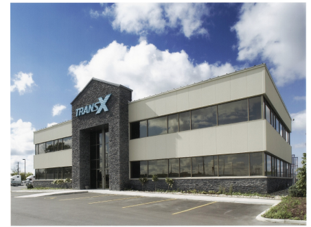
The TransX regional fleet office in Aberfoyle, a 10,000 s.f. Butler building.

TransX, based in Winnipeg, has one of the largest over-the-road trucking and intermodal service networks in North America, with terminals throughout Canada and the USA.