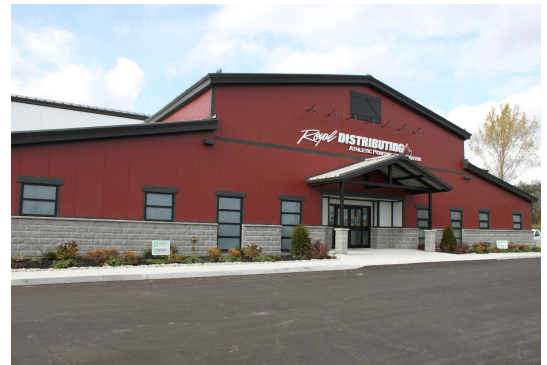
Royal Distributing Athletic Performance Center.

THE new Marden field house, now officially named the Royal Distributing Athletic Performance Center, held a grand opening ceremony on September 25 to celebrate the opening of the first public facility of its kind in Wellington County. Nearly 2,000 people attended the ceremonies which commenced with local dignitaries being piped onto the indoor field.