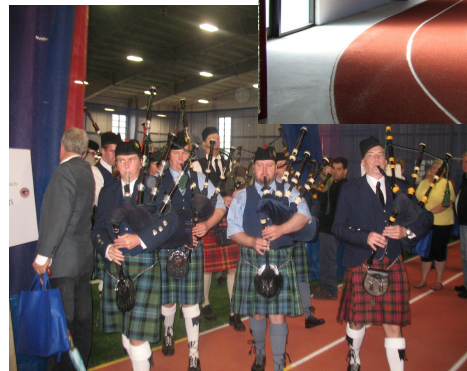
Pipes and drums at the grand opening ceremony.

You can check out KMA Updates online at http://www.kmacontracting.com/QuarterlyNewsletter.htm