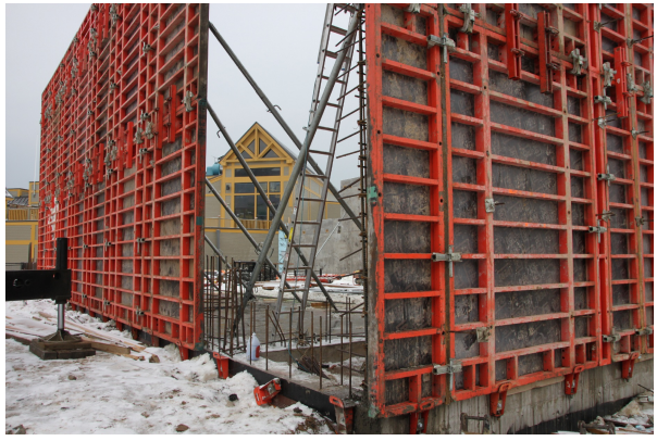
Formwork in place for the 24' high concrete walls.