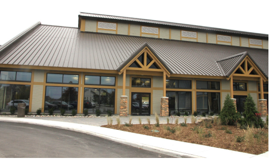
Blue Mountain Resort's new 46,000 s.f. convention centre / tennis hall addition.

over 46,000 s.f. more space, allowing the resort to host conventions and trade shows in its large multi-functional venue named The Courts. The facility is a combination of conventional